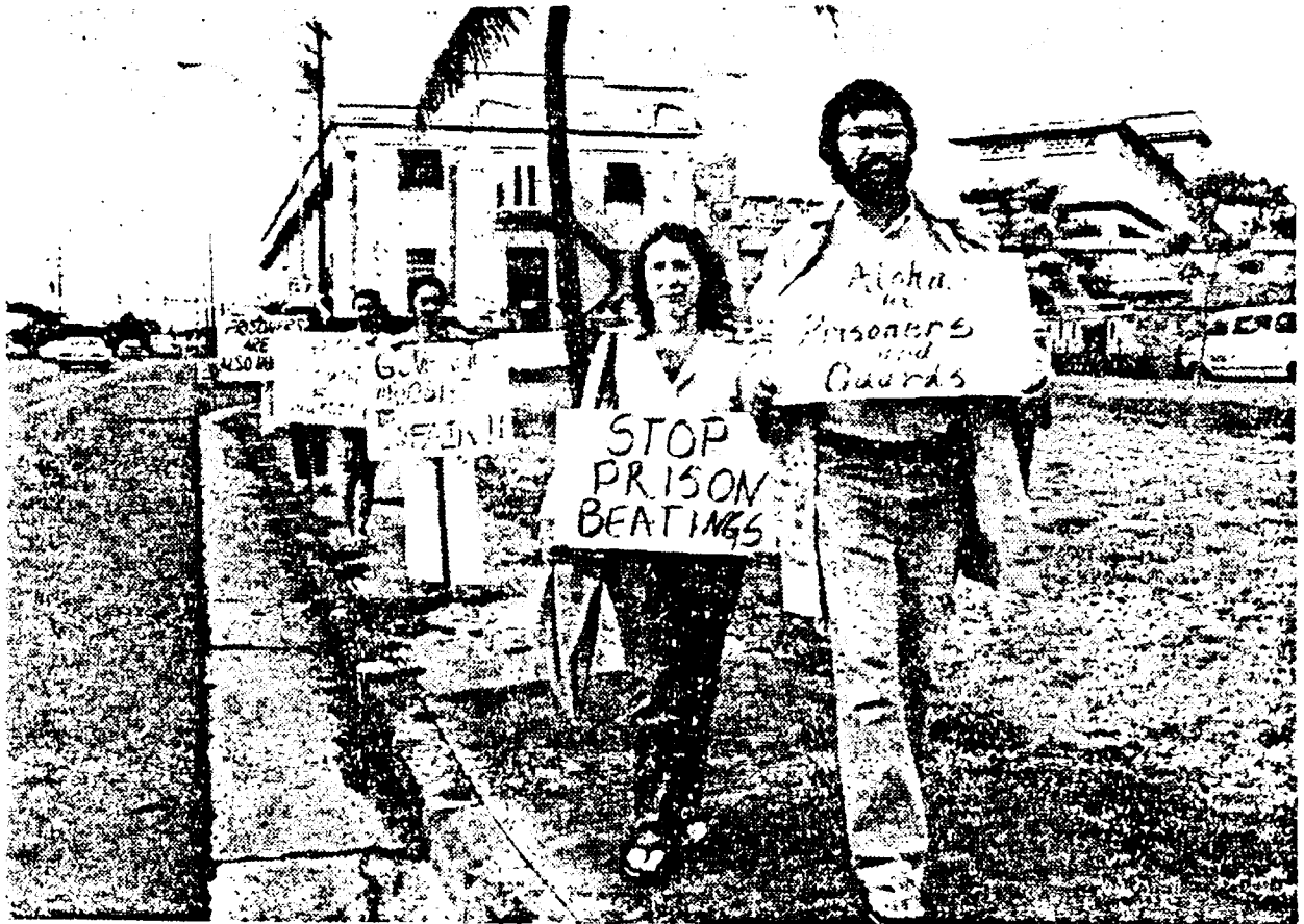
SYMPATHY FOR INMATES —Pickets walk the sidewalk outside the Oahu Community Correctional Center today, attempting to draw attention to what they describe as ill treatment of prisoners. The picketing was in connection with a sitdown strike this morning by the inmates inside the Kalihi facility.